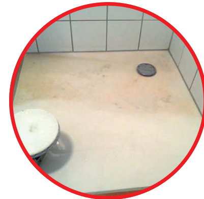
Cleaning of old safety shower tray with Blue Wave