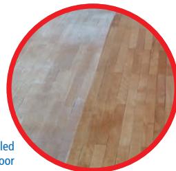
Reconditioning of oiled parquet floor