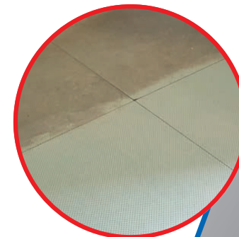
Hard flooring cleaned with Blue Wave, only with water