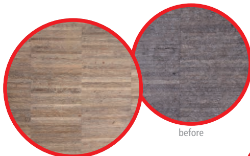
Renovation of old parquet floor